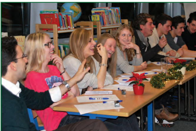
ISR alumni enjoying connecting with their friends from school

The SABIS® Alumni Global Association (SAGA) is an organization that is dedicated to reaching out to graduates from SABIS® Network schools around the world. Since 2011, SAGA has been providing alumni with support, services, and activities that are essential in order to maintain friendships formed at school.