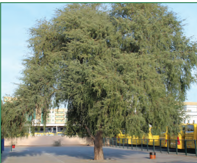
A rare tree that once stood alone in the desert now proudly stands on the ISC-Sharjah campus

In 1975, through a networking connection that came from a graduate of the International School of Choueifat (ISC-Choueifat) in Lebanon, SABIS® had the opportunity to open its first school outside the country. If the project went smoothly, a new branch of the International School of Choueifat would be established in Sharjah, a small and relatively unknown emirate back in the early 70s, and would be located initially on an old air force base. Challenges were coming though, among them getting supplies – textbooks, copybooks, pens, pencils, etc. – from Lebanon to the U.A.E through a supply chain that was frequently interrupted by a civil war.