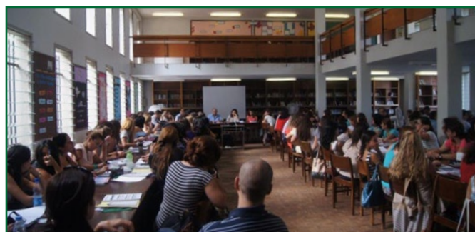
Participants at the teacher orientation program at ISC-Choueifat

The orientation program, which has been created and developed by the SABIS® Professional Development Institute (SPDI), includes a number of modules including SABIS® teaching methods, the SABIS Point System®, classroom management, use of IT in the classroom, and frequent testing methods to name a few. At the end of the orientation program, teachers have a clear overview of the curriculum and how to best engage their students in the learning process through the SABIS® teaching methods. They know how to positively address and handle potential disciplinary issues and are familiar with the various technological tools that are available for use in SABIS® Network schools.