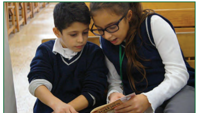
An older student at ISC-Choueifat reads to a younger student

“It is always a great chance for the prefects to make connections and bond with the younger students and help in building moral values by stressing important traits such as hard work and commitment to academic standards,” stated the Student Life Coordinator at ISC-Amman in Jordan.