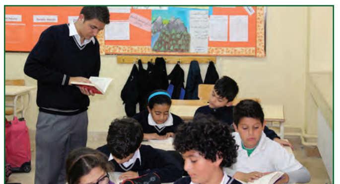
ISC-Amman Shadow Teacher® in action

Lower School Academic Department prefects also help younger students in the development of their reading skills. At ISC-Choueifat in Lebanon, the “Big Brother, Big Sister Reading Club” has been a huge success. “There is nothing more heartwarming than seeing big sisters and big brothers reading to the younger students. The prefects also play with the younger students, listen to them, and have fun, quality time!” said the Student Life Coordinator at ISC-Choueifat in Lebanon. Across the globe, in Massachusetts, U.S., a similar program introduced at the Holyoke Community Charter School has been a big hit.