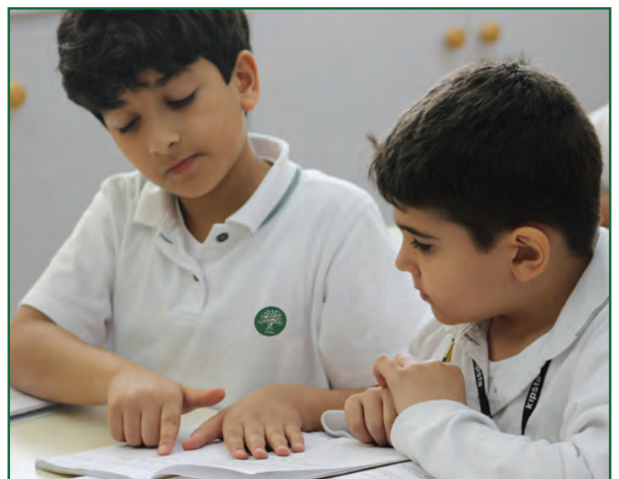
Peer tutoring in action in ISC-Sharjah

On an academic level, ISC-Sharjah implements the SABIS® Educational System, a comprehensive and challenging academic program that uses cutting-edge software and a distinct approach to teaching and learning. Like all SABIS® Network schools around the world, ISC-Sharjah implements the SABIS Point System® at all grade levels. Through the SABIS Point System®, students learn through a systematic learning process that engages them in both individual and group work.