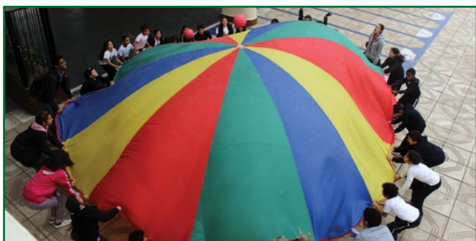
SLO® Lower School prefects organize fun activities at ISC-Lahore

The Lower School Activities Department is another of the Lower School departments that has been extremely active in schools across the network. At The International School of Minnesota (ISM) in the U.S., the Lower School Department organizes museum trips and special events where young students watch movies, swim, have dinner, and enjoy their time. In Egypt, ISC-Cairo Lower School prefects organized the "Make their Term" event. The older students planned different activities during the final two hours of each semester for the younger students to celebrate the end of term. At ISC-Lahore in Pakistan, senior prefects organize various creative and fun clubs for Lower School students during the SLO® Period. These clubs include board games, story time, art, sports, and recycling, to name a few.