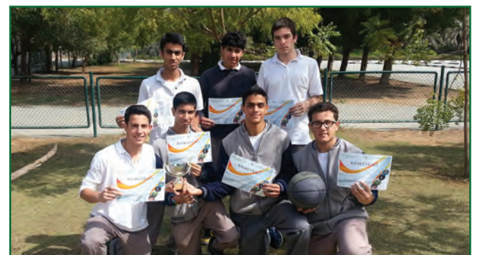
ISC-Sharjah SLO® basketball competition winners

At ISC-Sharjah, the SLO® is extremely dedicated to raising awareness about health issues in the emirate. One of the main health issues that the U.A.E. is facing today is the rise of diabetes within the general population and especially among children.