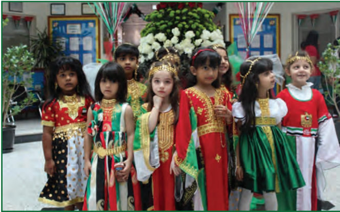
ISC-Sharjah students celebrating U.A.E. National Day

The school celebrates its cultural diversity in numerous ways. International Day, for example, is a bright and colorful celebration of the cultures that exist in harmony at ISC-Sharjah. The entire community – students, parents, and teachers alike – all come together to showcase dances, music, and food from the many cultures at the school. ISC-Sharjah also celebrates U.A.E. National Day in order to teach students about their local host country.